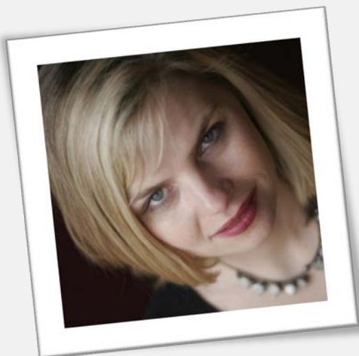
Author, Speaker, and Lipreading Mom

Join our campaign: http://LipreadingMom.com and click Lipreading Mom Captions Campaign . We can make a difference only if we let our voices be heard by those in charge.